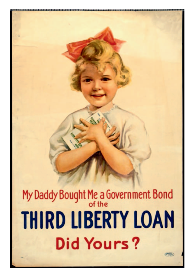
FIGURE 2. One of the posters used to advertise Liberty Bonds during the Third Liberty Loan program, which was started in April 1918.