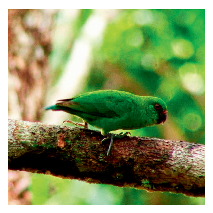
FIGURE 1. Finsch's Pygmy Parrot ( Micropsitta finschii ; also known as the Emerald Pygmy Parrot or Green Pygmy Parrot) is one of several parrots named for Finsch. This pygmy parrot inhabits tropical rainforests of islands in Papua New Guinea, the Solomon Islands, and the Bismarck Archipelago.

Survey in Washington, D.C., in 1904 and spent much of his career there working on economic mammalogy.