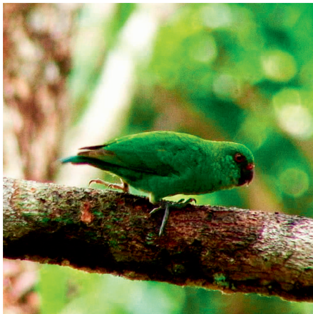
FIGURE 1. Finsch's Pygmy Parrot ( Micropsitta finschii ; also known as the Emerald Pygmy Parrot or Green Pygmy Parrot) is one of several parrots named for Finsch. This pygmy parrot inhabits tropical rainforests of islands in Papua New Guinea, the Solomon Islands, and the Bismarck Archipelago.

Survey in Washington, D.C., in 1904 and spent much of his career there working on economic mammalogy.