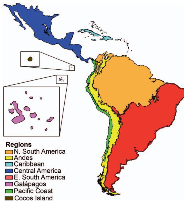
FIGURE 1. Map of biogeographic areas used in BioGeoBEARS eight-area regime. Five-area regime combined the four regions of South America mainland that are shown here.

likelihood analyses (>70 Bootstrap Support). This change in topology potentially alters the biogeographic interpretation of the origin of Darwin's finches. In addition, advances in biogeographic analyses in the last 15 yr indicate that a reassessment of the biogeography of the group is warranted. The R package BioGeoBEARS provides a framework for testing maximum likelihood and Bayesian models to reconstruct ancestral ranges (Matzke 2013a). The ability to customize models within this package allows new model types to be compared in addition to more widely used models. Therefore, we use the Burns et al. (2014) phylogeny and the more modern statistical approaches available through BioGeoBEARS to test a variety of biogeographical models. Using maximum likelihood, we estimate the ancestral ranges for all species in the subfamily Coerebinae and provide an update to the biogeographical analyses of Burns et al. (2002). Using this reconstruction, we evaluate the 2 proposed hypotheses for the origin of Darwin's finches in an attempt to provide consistency to the literature and to better understand the evolutionary context from which this radiation evolved.