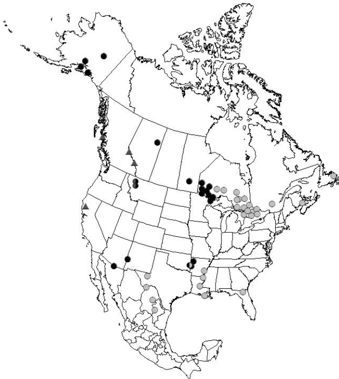
FIG. 1. —Map of sampling locations of black bears, including our Ontario sites and sites from other studies across North America. The Coastal phylogeographic clade is represented by dark gray triangles and the Continental clade by circles. The circles representing the 2 continental subclades are black for Continental Western subclade and light gray for Continental Eastern subclade. The circles that are both dark gray and black, located in Montana, represent sites where bears from both the Coastal and Continental clades were found. The circle that is both light gray and black, located in Oklahoma, represents a site where bears from both the Continental Western and Continental Eastern subclades were found. Based on the information provided by the median joining network (Fig. 3), the Ontario samples were attributed to each of the Continental subclades, the Northwest cluster belongs to the Continental Western subclade, and the other Ontario clusters belong to the Continental Eastern subclade.

and interpreted in the implementation of conservation and management plans for large carnivores.