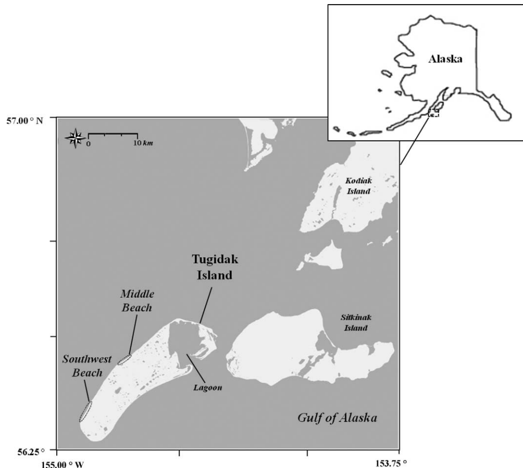
FIG. 1.—Map of Tugidak Island, Alaska. Harbor seals were monitored on 2 beaches: Southwest Beach and Middle Beach.

means of monitoring harbor seal populations (Cunningham 2009; Yochem et al. 1990), including estimating survival probabilities (Mackey et al. 2008) and reproductive performance (Thompson and Wheeler 2008). Although more labor-intensive than monitoring populations through artificial marks, efficiency and accuracy of this method was improved by a computer-assisted photograph-matching system (Hiby and Lovell 1990), even for very large photograph libraries from large haul-outs, such as at Tugidak Island (Hastings et al. 2008).