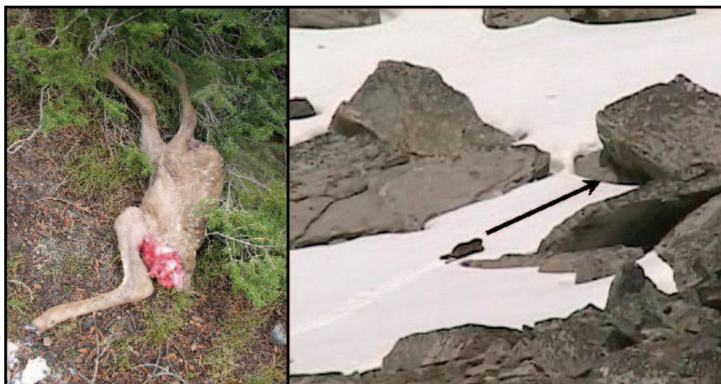
FIG. 3. —This elk calf was killed by a female wolverine ( Gulo gulo ) on 16 June 2004 in southwestern Montana. She had moved parts of the carcass to a rendezvous site where she had a cub. She dragged the remainder of the carcass to another cache site under large boulders (right photo) where there was ice that was likely to be present until autumn. Structure and cold temperatures may be critical habitat features for cache longevity because they inhibit competition from avian, mammalian (e.g., bears), insect, and bacterial competitors.

of the timing of reproductive events, summer foods appear to have an equally important role, and the limited information specific to summer diet indicates that predation on small prey occurs frequently in most areas (Gardner 1985; Lofroth et al. 2007; Magoun 1987; Packila et al. 2007). Total biomass obtained from small prey can be significant; 1 female was observed to eat 2 small mammals or ptarmigan chicks, an adult ptarmigan, a ground squirrel, and 2 eggs during a 2½-h period in June (Magoun 1987). In addition, wolverines have been documented as the main predator of woodland caribou calves during the calving season (Gustine et al. 2006), and predation on reindeer and other ungulate neonates occurs (Björvall et al.