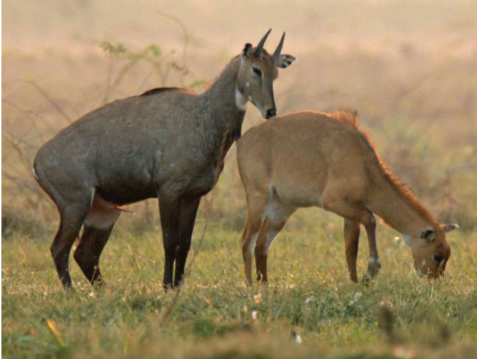
Fig. 6. —Premounting behavior of Boselaphus tragocamelus in Koleado National Park, western India, December 2004.

often at distances of > 75 m between conspecifics (Fall 1972; Sheffield et al. 1983). Threats are more serious than dominance displays and include a straight-necked threat displayed frontally and usually \leq 10 m from a conspecific (while stationary, walking, or running toward opponent) and rush threat from a normal stance or after a lateral display with lowered neck, head toward the ground, and horns horizontal (contact and goring of the thighs or flank are common, and chases of \leq 750 m have been observed—Fall 1972; Sheffield et al. 1983). While displaying, males may circle one another crouched and with a stiff posture (Cowan and Geist 1961; Fall 1972).