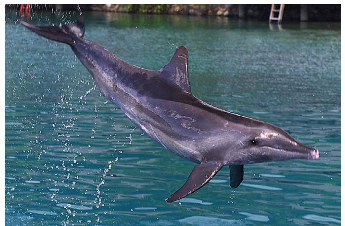
Fig. 1. —Pubertal male Steno bredanensis from Dolphin Quest French Polynesia, photographed in 2000. Dolphin Quest French Polynesia (The Moorea Dolphin Center) is a captive-care facility that houses dolphins in French Polynesia, located in the South Pacific.

Steno compressus Gray, 1846:43, pl. 27. Type locality unknown.