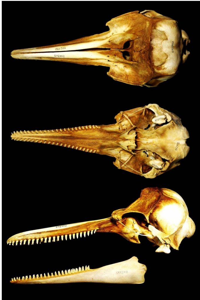
Fig. 2. —Dorsal, ventral, and lateral views of the skull and lateral view of mandible of an adult female Steno bredanensis (National Museum of Natural History 572792). Note that view of the right mandible has been reversed to align it with the cranium. Specimen is from Wreck Island, Virginia. Condylbasal length of skull is 503 mm.

NOMENCLATURE NOTES. The historical nomenclature of S. bredanensis is particularly confusing. Schevill (1987) and Flower (1884) have both provided accounts of this history. The fate of the type specimen is unclear and it may have been lost. The relationship between S. perspicillatus and S. bredanensis is addressed by Fraser (1966).