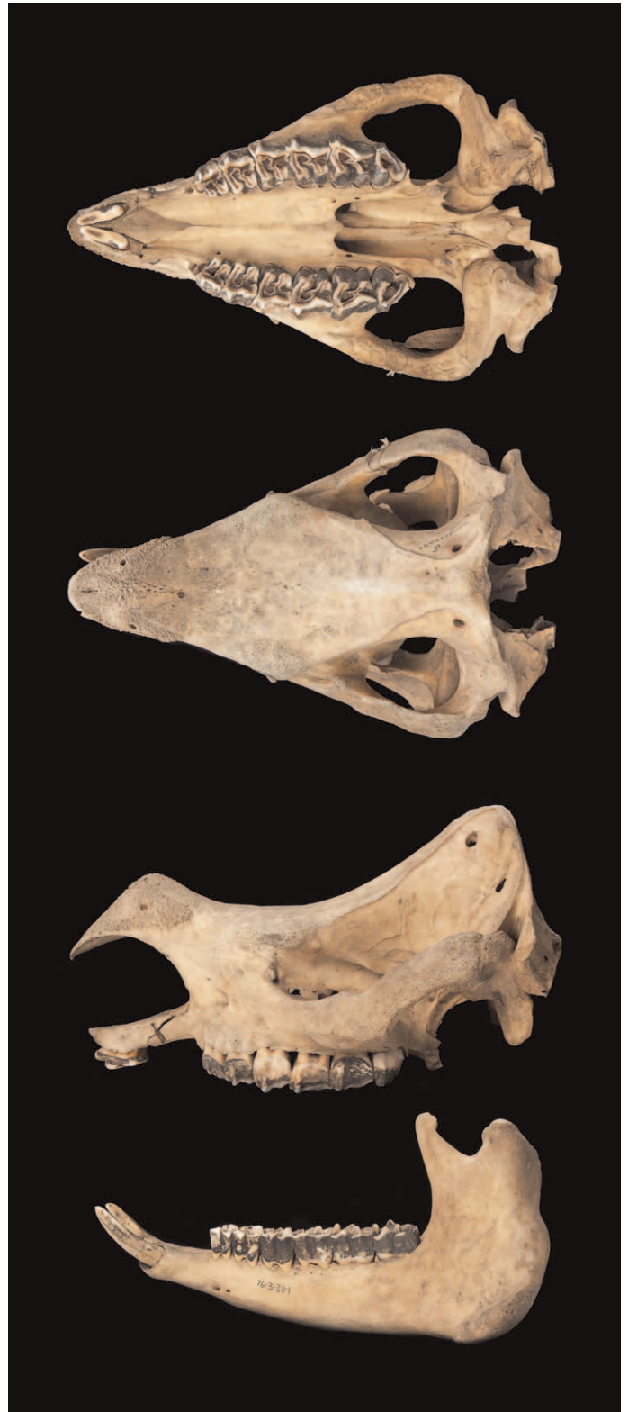
Fig. 4. —Ventral, dorsal, and lateral views of skull and lateral view of mandible of a mature male Rhinoceros sondaicus (Natural History Museum [London] specimen 1876.3.30.1) collected in the Sunderbunds, West Bengal, India, in 1876. Greatest length of skull is 523 mm.