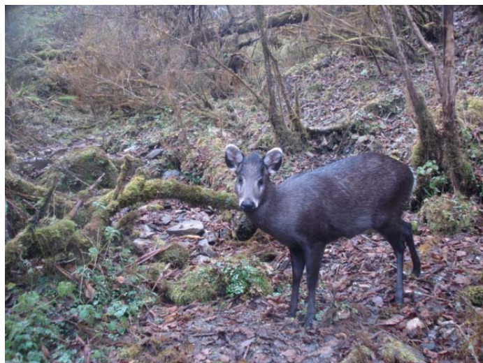
Fig. 5. —Typical forested habitats of Elaphodus cephalophus in southern China tend to have open understories but often with abundant shrubs (not obvious here) and herbaceous vegetation for cover and food. Photograph taken during the camera-trap surveys of Li et al. (2012) in Sichuan, Gansu, and Shaanxi provinces, China, and freely available at Smithsonian Wild ( www.siwild.si.edu ).

Shaanxi (Zeng et al. 2007), and Tangjiahe Reserve, Sichuan, where they were found significantly disjunct from human settlements (Wang et al. 2006).