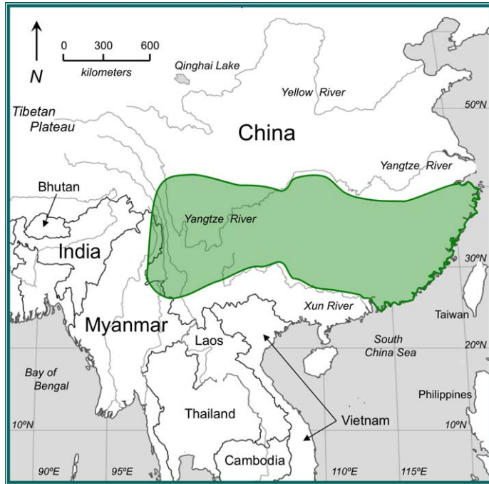
Fig. 2. —Distribution of Elaphodus cephalophus in a large area of southern China from the eastern reaches of the Tibetan Plateau to the southwestern coastal mountains and northwestern Myanmar; occurrence in Myanmar is based on historical records because no recent observations of E. cephalophus have been made there (base map from Brigham Young University's Geography Department, https://geography.byu.edu/pages/resources/outlineMaps.aspx ).