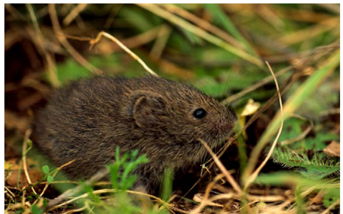
Fig. 1. —Wild-ranging adult Microtus cabreræ (sex not determined) near Bicos, Odemira, southwestern Portugal (37°48'N, 8°30'W), May 2004.