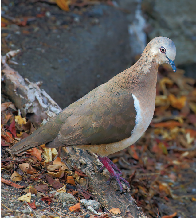
FIGURE 1. When a Grenada Dove is flushed from a perch by an approaching observer, it will fly a short distance to another perch or to the ground and walk slowly away to find cover. Grenada Doves can also be seen singly or in small clusters drinking water and foraging on the ground in forested areas.

and k is the number of survey points. We truncated the distance data ( w = 340 m) and estimated detection probability as