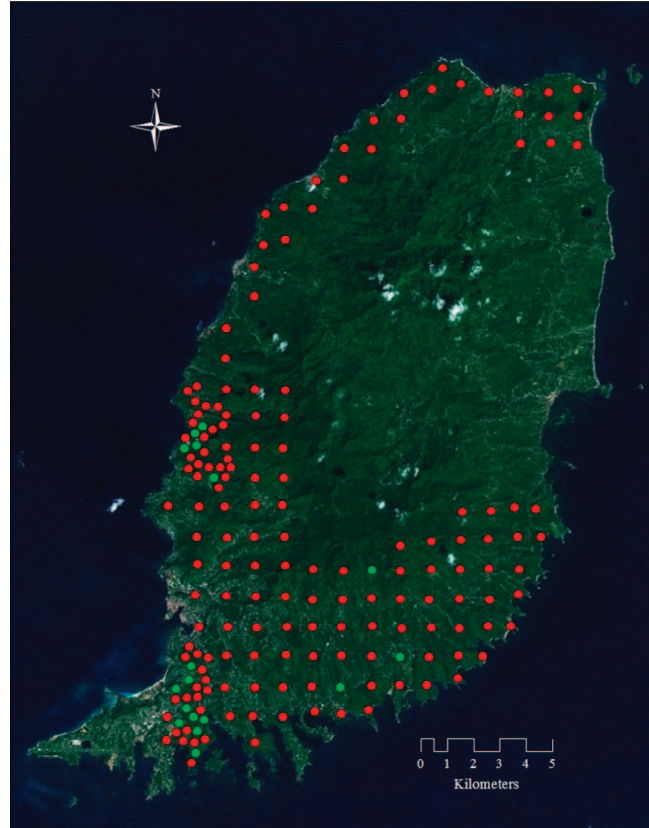
FIGURE 2. Map of the island of Grenada (area \sim 34,400 ha; 12.00^\circ\text{N} , 61.78^\circ\text{W} ), showing the survey region, which covered 7,621 ha. Green circles are for survey points where Grenada Doves were detected during July 19–31, 2013.

A 6-min count increased the chance of detecting calling doves visually, facilitating distance measurements with rangefinders. However, when calling doves were not seen, we measured distances to the nearest horizontal locations and used distance categories (0–15, 16–30, 31–45, 46–60, 61–90, 91–120, 121–180, 181–240, 241–340, and 341–440 m; Rivera-Milán et al. 2003b, 2014). Moving doves were not