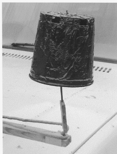
Fig. 1. The “trolling” deerfly trap: A. truck-mounted apparatus used in experimentation, B. cup version mounted on cap for personal protection and C. individual trap that can be mounted on a lawnmower, 4-wheeler or other vehicle to suppress deer flies from dooryards and other locations.

traps of each color were used and the pots of the 3 colors were grouped in two sets to begin the first replicate then randomized as described above.