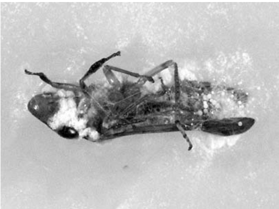
Fig. 1. Mycelia of Pseudogibellula formicarum emerge from dead glassy-wing sharpshooters collected from the treated samples after 4 days incubation at 27 ± 1°C, 85% RH. The sharpshooters were surface-sterilized and plated on SMAY to investigate the recovery of the fungus.

epizootics. However, additional studies are need to provide a better understanding of host-pathogen interactions, and identify the factors that enhance or limit disease increase in sharpshooter populations under natural conditions. In addition, the sharpshooter was found to be also a suitable host for Metarhizium anisopliae . Overall, P. formicarum and M. anisopliae could provide new avenues for the biological control of the glassy-winged sharpshooter and complement current control strategies.