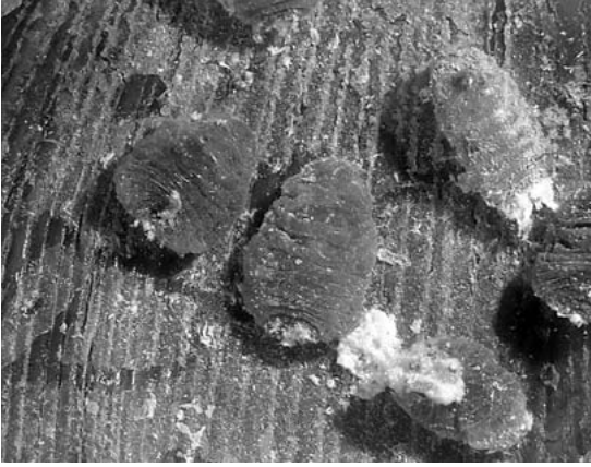
Fig. 2. Palmicultor lumpurensis adults on bamboo.

economic impact of these invasive species for Florida's bamboo is not yet known. Monitoring of populations from each of these invasive species