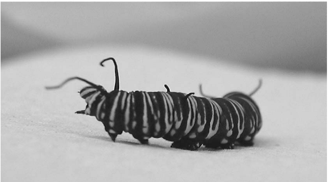
Fig. 1. Two of 11 monarch butterfly larvae with three tubercle pairs found in South Florida. Photos taken by A. K. Davis on Jan. 12, 2004.