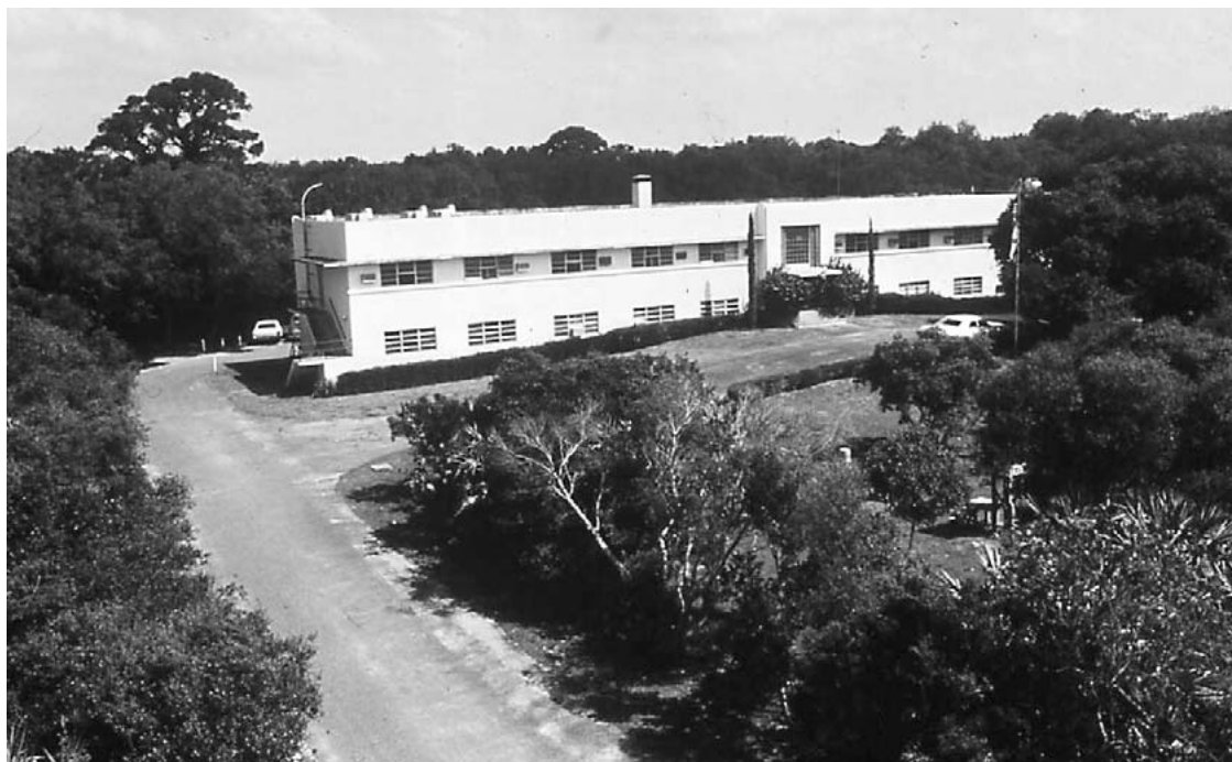
Fig. 3. The Florida Medical Entomology Laboratory at Vero Beach, Florida, as dedicated in 1957.