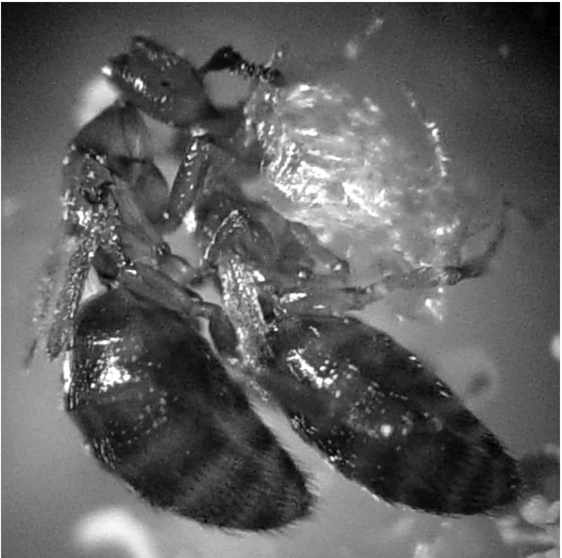
Fig. 1. A male of Melittobia digitata Dahms that appears to be feeding on a sibling male.

Combat between males of Melittobia digitata is particularly intense. We noticed that M. digitata males in our laboratory cultures sometimes spent an extended period of time with their mandibles immersed in the tissues and hemolymph of a defeated male (Fig. 1). In one instance, a male killed an emerging male by biting through the emerging male's head capsule, and then inserted his mandibles deeper into the head capsule. The victor's palpi were highly active, with motions resembling those of feeding females. As we watched,