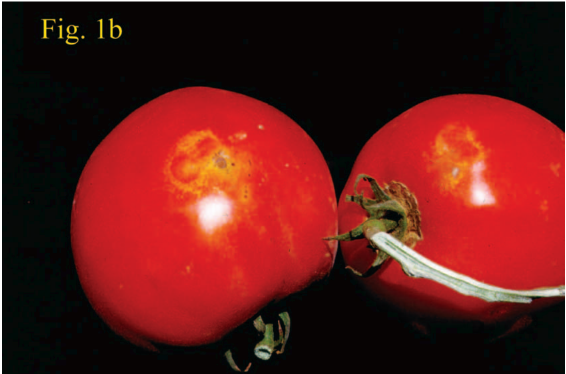
Fig. 1. (a) Goldflecks on tomato caused by feeding of F. occidentalis (Pergande). (b) Goldfleck rings on tomatoes at the spot they were touching each other, caused by feeding of F. occidentalis (Pergande).