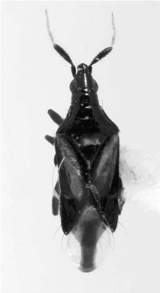
Fig. 1. Montandoniola moraguesi , dorsal view.