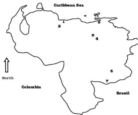
Fig. 1. Distribution of Heterotermes tenuis in Venezuela.

We found that H. tenuis is distributed around the northeastern and southern Venezuela in several habitats (Fig. 1), and is present at different altitudes from 10 to 1100 m (Table 1). The specimens found were soldiers and workers. We found minor soldiers only in the sample from Los Cerritos (Fig. 2, Constantino 2000). The measurements for H. tenuis ( n = 14 major soldiers) were 3.0 \pm