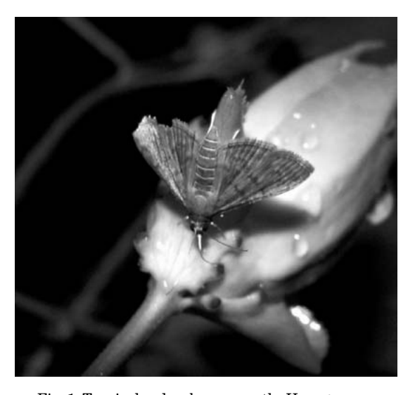
Fig. 1. Tropical sod webworm moth, Herpetogramma phaeopteralis Guenée, feeding on extrafloral nectary of Passiflora incarnata L.