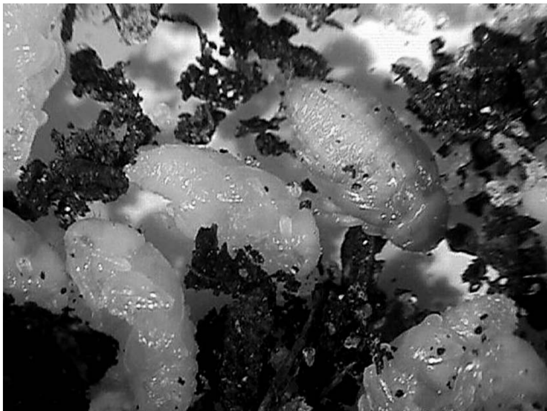
Fig. 4. Weevil pupae that exited the amaryllis bulb as larvae and pupated in the soil.