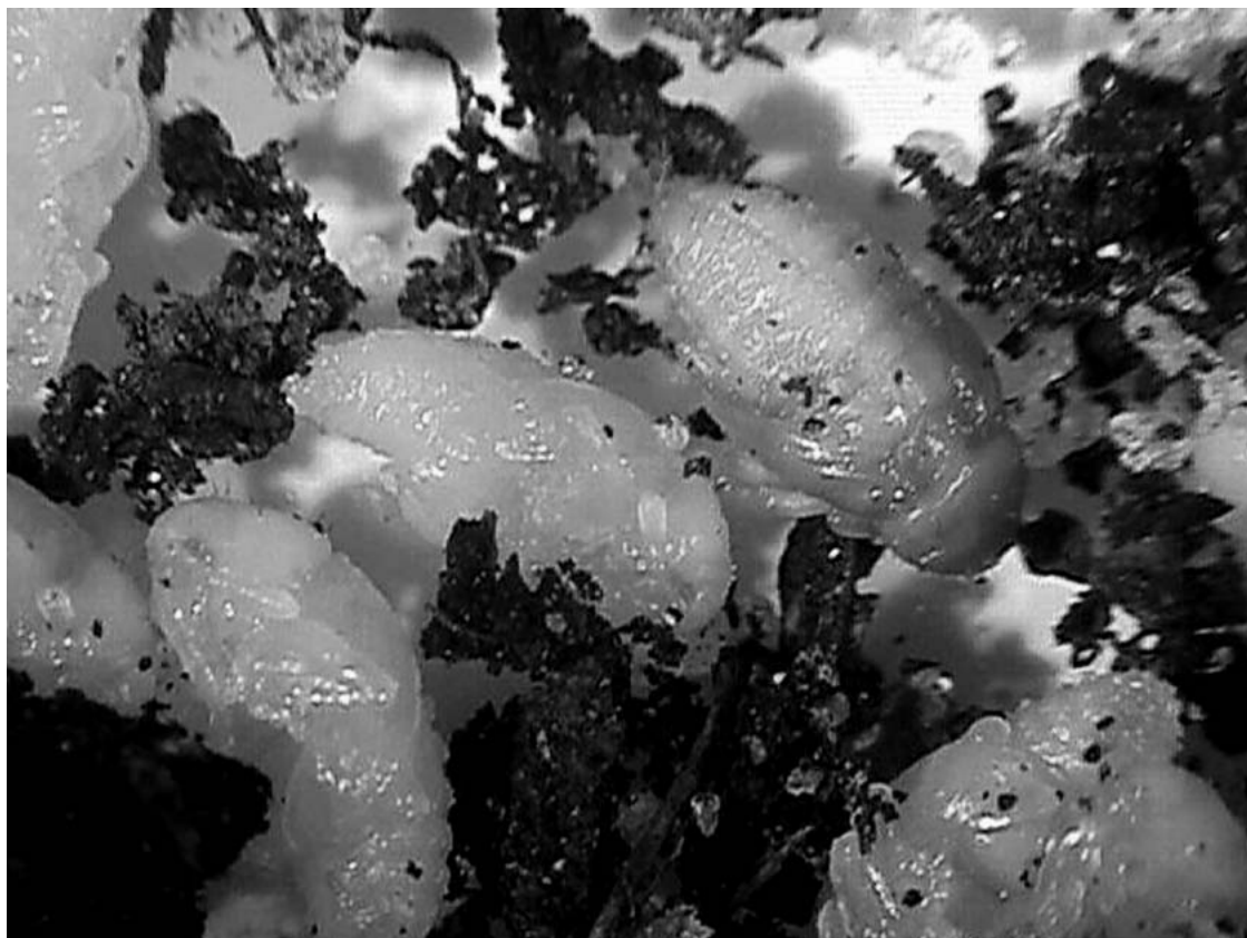
Fig. 4. Weevil pupae that exited the amaryllis bulb as larvae and pupated in the soil.