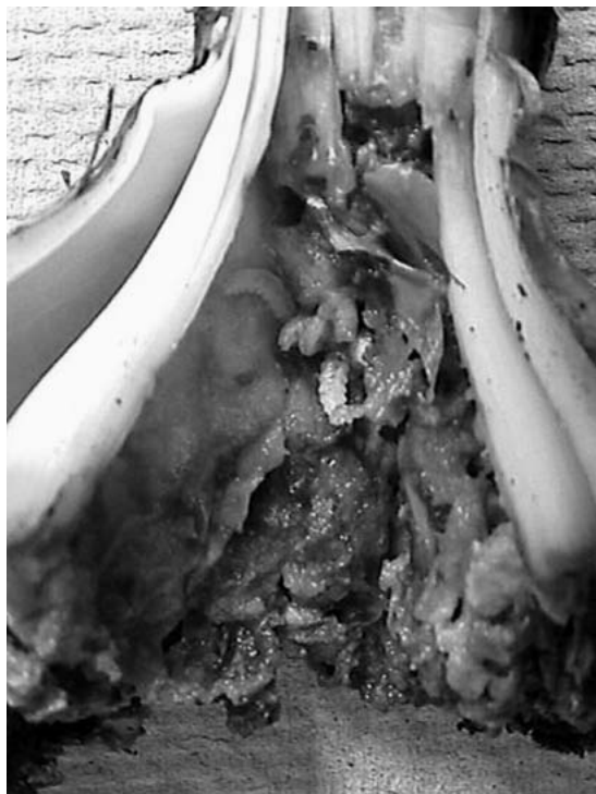
Fig. 3. Weevil larvae and heavy damage to an amaryllis bulb due to a high level of larval infestation.

pared with that obtained in the oviposition study (above) may be because eggs were dissected from the plant tissue within 24 h of oviposition (experiment 1) versus between 24 and 48 h of oviposition (oviposition study), respectively. Total time period from oviposition to adult eclosion averaged 47.4 \pm 3.7 d. Larvae stayed within the leaf tissue so number of instars was not determined. Late instars exited the tissue, moved into the vermiculite and became non-feeding prepupae. Of the larval developmental time, 9.9 \pm 2.9 d (range 3-16 d) were spent as prepupae. Newly eclosed, teneral adults were light brown in color and did not feed. It took an additional 3.8 \pm 1.1 d (range 1-6 d) for adults to become solid black and begin feeding.