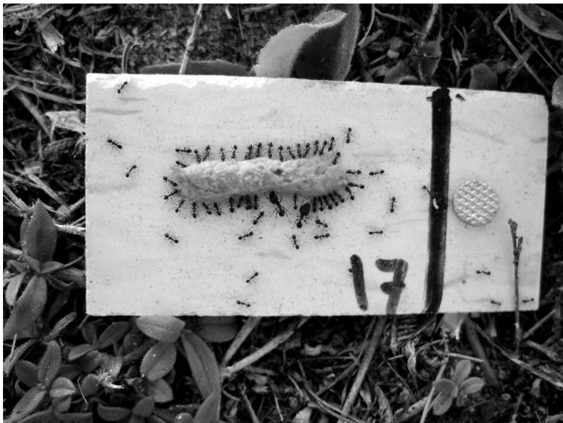
Fig. 2. Count station (approx. 3.5 \times 7 cm). Bigheaded ants are feeding on oil/protein bait. Ants on the tile to the left of the black line were counted. A nail to the right of the line holds the tile in place on the soil surface.

tained lower numbers than the other treatments. These relationships continued to 28 DAE after which data were no longer collected.