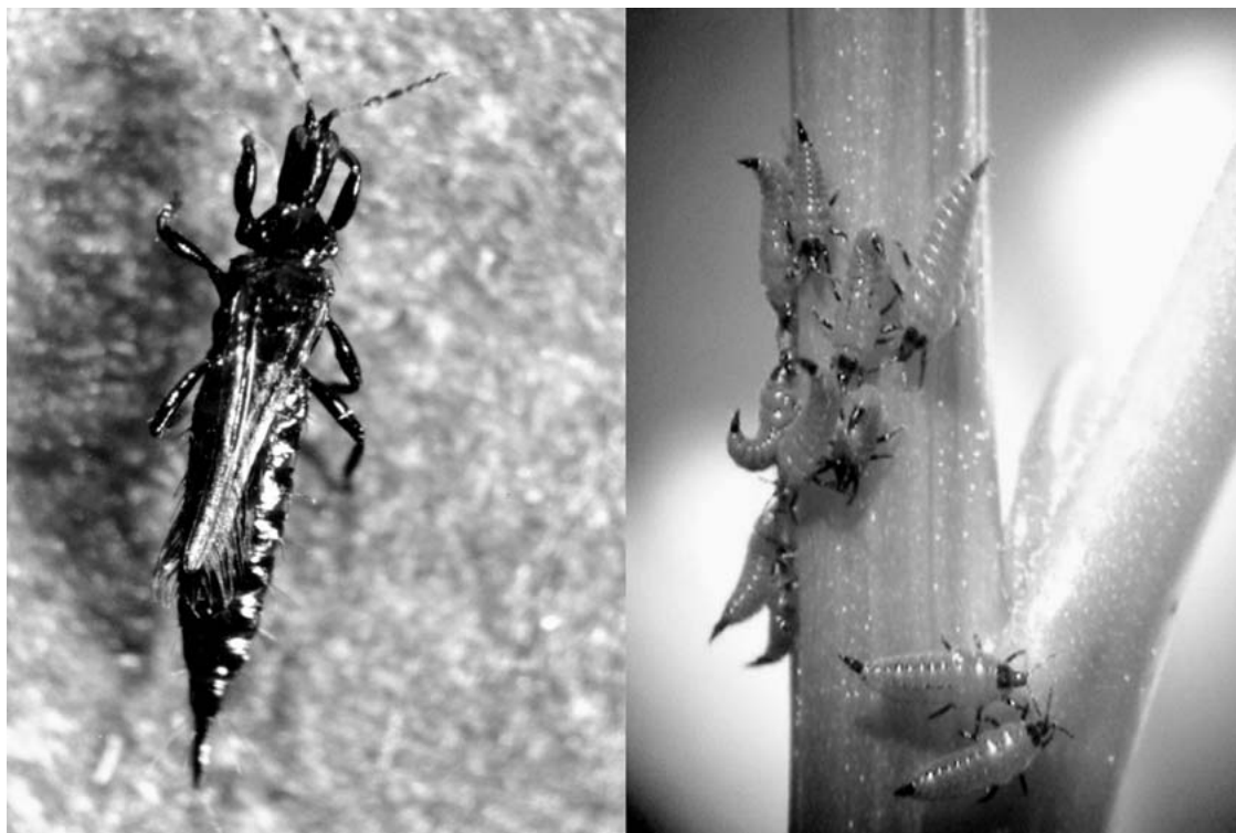
Fig. 1. Adult female (left) and cluster of larvae of P. ichini on stem of Brazilian peppertree, Schinus terebinthifolius (Photo credits: Marcelo Vitorino and Veronica Manrique).

thrips from escaping. Each cage was labeled with a colony number, the host plant species, and the date. Approximately 20 to 25 d after the parental adults were placed on the plant, a new generation of thrips larvae was produced. Developing larvae were collected by cutting a shoot tip with scissors and carefully transferring the thrips-infested shoot into a 50-dram clear plastic snap cap vial with holes punched in the lid with a teasing needle for ventilation; the holes were sealed with a piece of Kimwipe® sandwiched between the lid and the vial. A freshly cut young shoot of the same host plant species (~8.5 to 9 cm long) was placed inside the vial as a food source. Before using the new shoot tip, we sprayed it with a 10% bleach solution in order to kill bacteria and fungi, and then thoroughly rinsed it with tap water. A piece of standard filter paper (9 cm diam.) moistened with a few drops of tap water was placed in the vial to maintain humidity. A maximum of 80 larvae was placed inside each vial. The snap cap vials were transferred to larger, round, clear plastic containers (26 cm diam × 9 cm ht) and placed inside a growth chamber set at 23.0°C and a 16:8 (L:D) photoperiod.