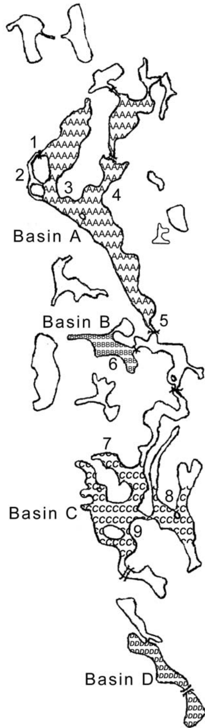
Fig. 1. Map of study wetlands for Chironomidae showing Basins A to D (larval sampling) and location of New Jersey light traps 1 to 9 (adult sampling), Ponte Vedra Beach, Florida, USA.

Technical grade s -methoprene (96% AI) was tested in small rearing units with continuous air supply (Ali & Lord 1980). Larval and/or pupal