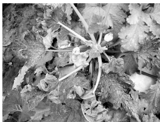
Fig. 1. Cucurbit leaf crumple virus symptoms recorded on zucchini squash plants in Citra, FL (2006), with severe Silverleaf symptoms in the background.

In related studies reflective mulch alone has successfully delayed and decreased the spread of viruses transmitted by various insect pests (Reitz et al. 2003; Stapleton & Summers 2002; Summers et al. 2004). Alternatively, living mulch has also been reported to reduce whitefly and aphid numbers and the incidence of insect-borne viruses in zucchini squash and tomatoes, respectively (Hooks et al. 1998; Hilje & Stansly 2008). When