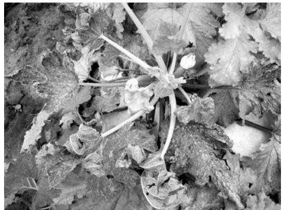
Fig. 1. Cucurbit leaf crumple virus symptoms recorded on zucchini squash plants in Citra, FL (2006), with severe Silverleaf symptoms in the background.

In related studies reflective mulch alone has successfully delayed and decreased the spread of viruses transmitted by various insect pests (Reitz et al. 2003; Stapleton & Summers 2002; Summers et al. 2004). Alternatively, living mulch has also been reported to reduce whitefly and aphid numbers and the incidence of insect-borne viruses in zucchini squash and tomatoes, respectively (Hooks et al. 1998; Hilje & Stansly 2008). When