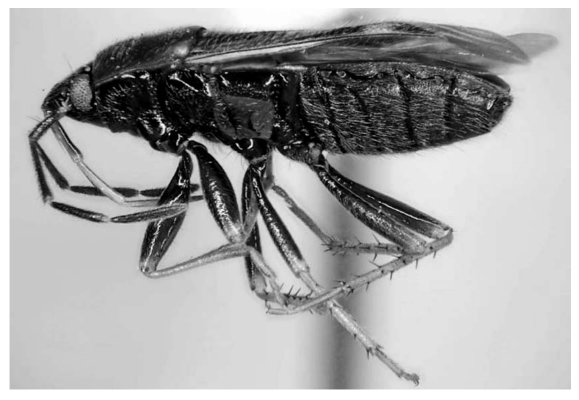
Fig. 2. Paragonatas divergens, adult female, lateral aspect.

The earliest record from the Golia collection, Jan 25, 1991, from a light trap on Key Largo, predates the previous earliest known collection in Florida by 12 years. In addition, based on these new records, P. divergens is reported for the first time from Monroe and Palm Beach counties in Florida. Paragonatas divergens has been in Florida for at least 16 years and evidently is well established throughout the southern peninsula, although in apparently low numbers.