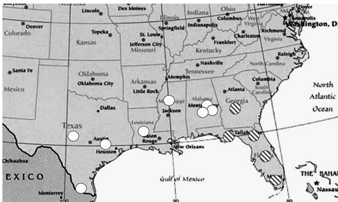
Fig. 3. Locations of the corn-strain fall armyworm haplotype profiles in selected states in the southeastern U.S. Circles with diagonal lines display the Florida profile, clear circles indicate the Texas profile. Data from Nagoshi et al. (2008).

The highly mobile and genetically diverse fall armyworm presents many technical challenges for studies on migration and population dynamics. Traditional methods of field observations, trap captures, and synoptic weather analysis have generally supported but only marginally added to the early estimations of fall armyworm migration (Luginbill 1928). However, relatively recent advances in molecular techniques make possible a far more detailed analysis of fall armyworm movements that begins to take into account the presence of genetically define subpopulations. In the near future, we anticipate mapping the annual migration of the corn-strain population throughout North America from their overwintering sites in Texas and Florida, and extending this analysis to compare the historical movements of the Brazil and Florida subgroups of this strain in the Caribbean, South America, and Central America. As more genetic markers are uncovered it may be possible to perform analogous studies on the rice-strain and interstrain hybrid populations to develop a more complete description of the migratory behaviors of this important agricul-