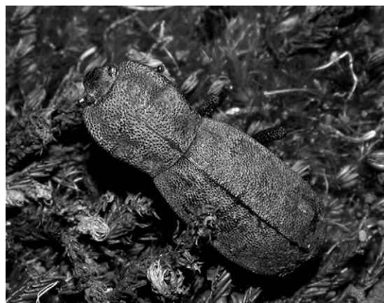
Fig. 1. Habitus of a live specimen of V. aequalis from Tlaquilpa, Veracruz, Mexico.

This interpretation is supported by the distribution range of specimens we have studied, from several localities of the State of Oaxaca including some in the vicinity of Cerro San Felipe. However, the distribution of V. aequalis is not narrowly restricted, but ranges through a great portion of the mountains of northern Oaxaca, along the Sierra Aloapaneca, Sierra Mazateca and Sierra de Juárez, including a small area in the neighboring mountains of Veracruz (Fig. 2). The latter locality represents a new record for the state of Veracruz.