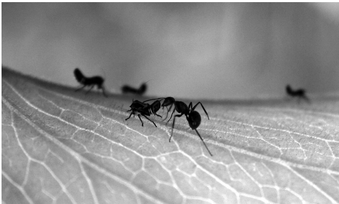
Fig. 2. A Camponotus crassus worker foraging honeydew from Rotundicerus sp. nymph (Cicadellidae, Idiocerinae) in a cerrado area of the Federal District, Brazil.

It is possible, as described for R. minutus (Dietrich & McKamey 1990), that eggs may be inserted almost completely into the stem or the leaf vein of the host plant, but we did not observe this.