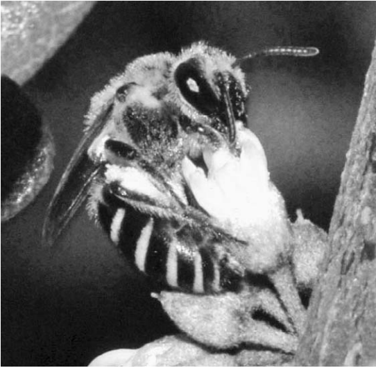
Fig. 1. Female Colletes francesae visiting flowers of Sideroxylon tenax .