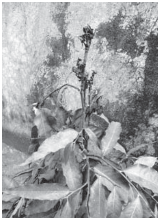
Fig. 4. A 6-month old Polyalthia longifolia plant severely damaged by Crotonothrips polyalthiae .

The presence of this leaf-galling thrips significantly affected plant height, stem circumference, and the number of healthy young leaves produced by the experimental plants (Table 3). Pre-treatment observations showed that there were no significant differences in plant height, stem circumference, and the number of uninfested young