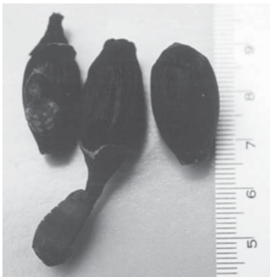
Fig. 3. Larva of Thepytus echelta (Lycaenidae) on the peduncle of Psittacanthus acinarius (Loranthaceae) fruit.

only species that expressed some potential for use as a biological control agent against this mistletoe. This is because the caterpillars produced a hole in the pericarp of the fruit to reach the seeds that indeed they did eat, thus eliminating the cotyledons and the viscin. Because of this behavior T. echelta may completely impede seed germination. However, their population during the period of the survey was very low (Table 2).