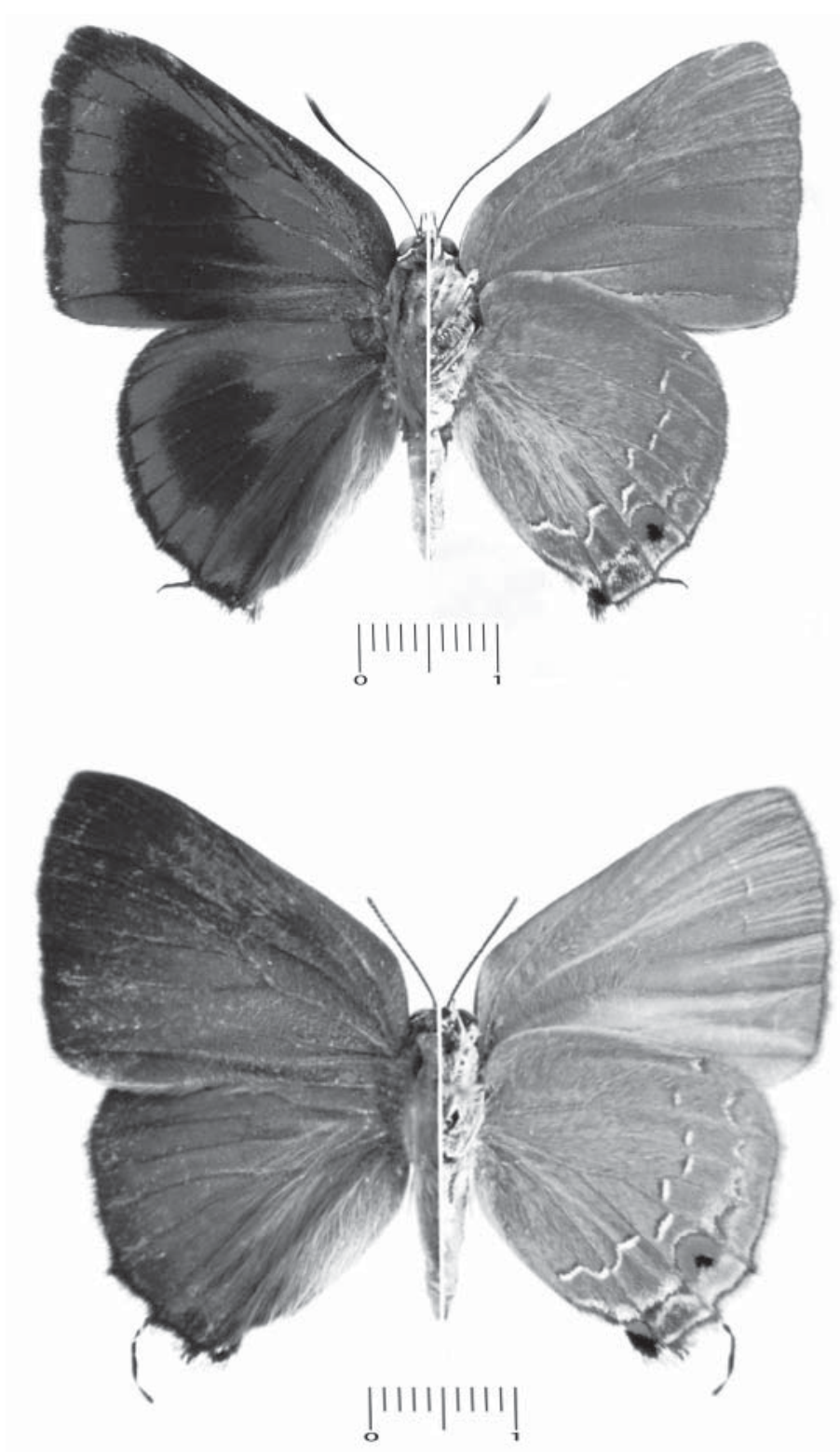
Fig. 2. Male (above) and female (below) of Thepytus echelta (dorsal [right] and ventral [left] views, respectively).