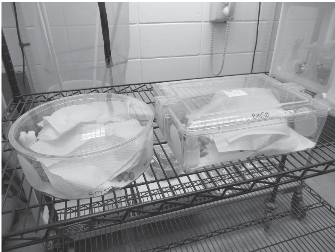
Fig. 1. Clear plastic rectangular and circular containers for rearing Halyomorpha halys .

significantly improved the BMSB rearing success. Other foods occasionally added to the diet included raisins [ Vitis vinifera L. (Vitaceae)], apple [ Malus pumilla Mill. (Rosaceae)], papaya [ Carica papaya L. (Caricaceae)], mango [ Mangifera indica L. (Anacardiaceae)], okra, orange [ Citrus sinensis (L.) Osbeck (Rutaceae)], tangerine [ Citrus tangerine (Tanaka) Tseng (Rutaceae)], cucumber [ Cucurbita sativus L. (Cucurbitaceae)], jalapeño [ Capsicum frutescens L. (Solanaceae)], tomato [ Lycopersicon esculentum Mill. (Solanaceae)], strawberry [ Fragaria × ananassa (Rosaceae)], common ragweed [ Ambrosia artemisiifolia L. (Asteraceae)] bouquets and other seasonal produce. Layers of Kimwipes® Kimberly-Clark and paper towels were placed inside the containers to provide an oviposition substrate, hiding places, and additional surface area. Egg masses were hand collected every other d. This method proved to be very effective for obtaining fresh high quality eggs (Fig. 2). To avoid egg predation by adults and to avoid overcrowding, egg masses were collected regularly and placed in a separate labeled container. Nymphs tended to feed on the eggs, and