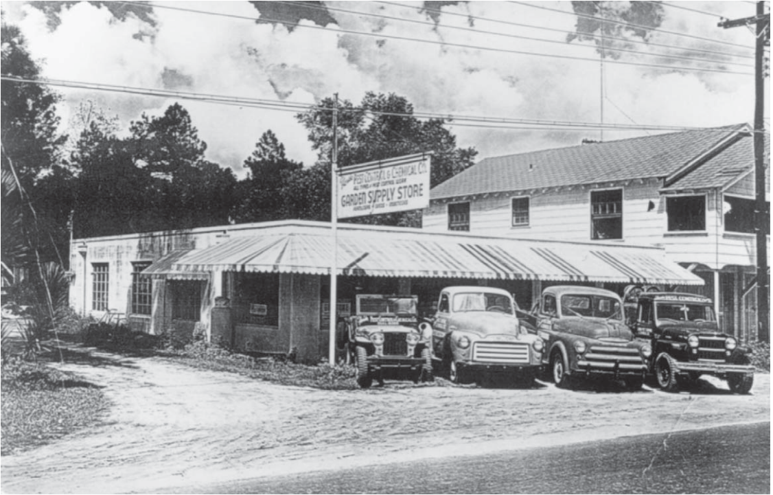
Fig. 2. Florida Pest Control & Chemical Co. Office in 1949.

A method was needed to treat the interior expansion joint from outside of the structure. Dempsey had a student named Butch Sinclair helping him part time. While treating a floating slab foundation for subterranean termites, Sinclair proposed drilling from the outside wall and using a \frac{1}{4} -inch pipe under the slab to treat the underlying fill dirt and expansion joint. They tried it, and to the best of Dempsey's knowledge, that was the first subterranean termite treatment performed in this manner. Dempsey then started using longer rods, some up to 60 feet long. This method was not only less intrusive; it also reduced the odor of the termiticide and exposure of residents in the structure.