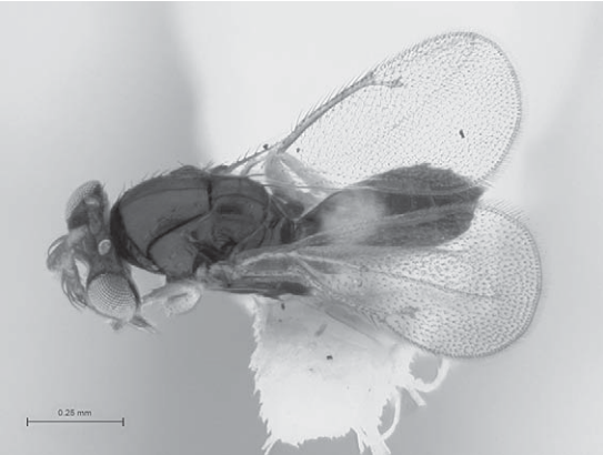
Fig. 2. Male Aprostocetus ( Aprostocetus ) sp. (all females were slide mounted for identification and were not photographed prior to mounting). The color version of this figure is available online in Florida Entomologist 96(2) (2013) at http://purl.fcla.edu/fcla/entomologist/browse .