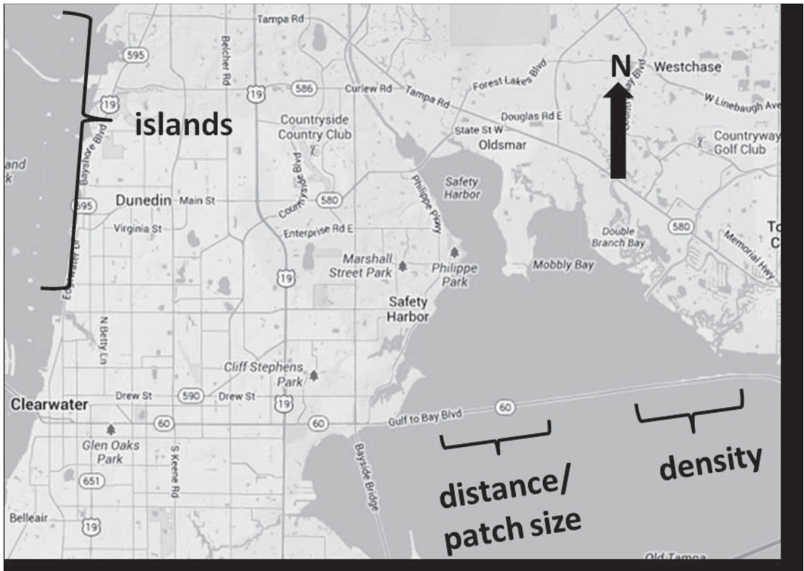
Fig. 1. Map showing overview and relative location of each of the 3 studies. Tampa (Hillsborough County), Florida is to the east.

east side of the CCC bridge is an extensive area of B. frutescens forming a continuous ground cover matrix with I. frutescens shrubs emerging intermittently, such that the distance between the host species is zero; moreover, relative host plant abundances vary with varying Borrhichia stem density (Fig. 2). Monthly gall counts were performed from Jan 2009 to Sep 2009 to determine gall densities on I. frutescens and B. frutescens . Additionally, areal density of potential oviposition sites (leaf buds) on Borrhichia on both sides of each I. frutescens shrub in the study was measured and the local average determined. Emergence holes were counted concurrently on both species and classified according to whether they were the result of emerging gall midges or parasitoids (Stiling & Rossi 1997). Linear regression analysis was performed using I. frutescens gall density and parasitism rate as response variables and B. frutescens gall density, oviposition site areal density and parasitism rate as independent variables influencing Iva gall density. We predicted Iva gall density to be lower and parasitism rate higher as Borrhichia gall density, oviposition site density and parasitism rate increased.