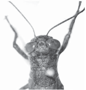
Image 4. Clonacris kirbyi Finot Dorsal view of head

Fig. 1. Clonacris kirbyi Finot collected at Patgaon, Taluka Chandgad, Dist., Kolhapur [N 16° 07' 40.66" E 73° 56' 04.15", 2098 ft (639.5 m) asl], northwestern Ghats, Maharashtra, India.