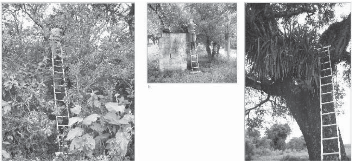
Fig. 2. Mosquito habitats provided by the Aechmea distichantha , a bromeliad epiphyte in the Yungas of north-western Argentina. (2a) Aspect of residual primitive forest in Monte Bello, meters from bromeliads where larvae of Ae. aegypti were found. (2b) Aspect of the abandoned building where epiphytic bromeliads were found from which the larvae of Ae. aegypti were collected. (2c) Epiphytic bromeliads from which larvae of Ae. aegypti and Cx. quinquefasciatus were collected at Iltico.

and Cx. quinquefasciatus in bromeliads located in wild and semi-urban environments could indicate a possible degree of invasion and adaptation to the primitive forest, or they may be a consequence of high infestations levels in nearby houses (Malta Verajao et al. 2005). This finding requires in-depth studies to reveal the real behavior of these