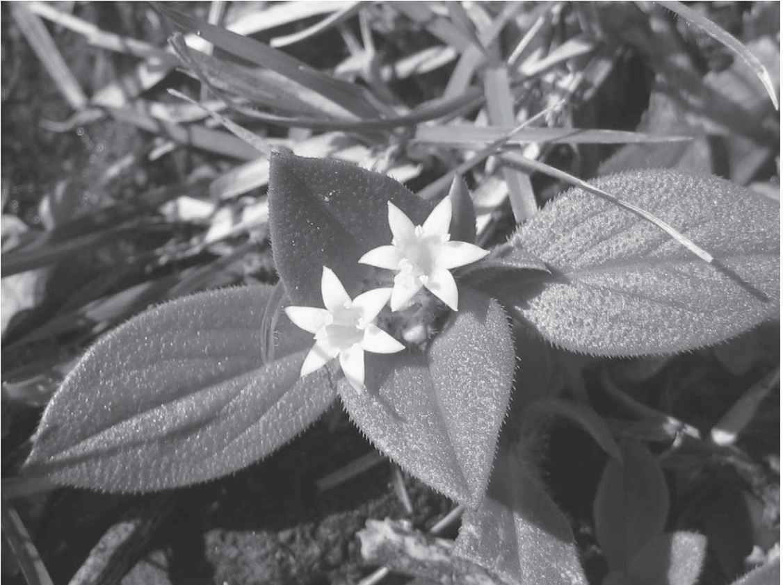
Fig. 9. Richardia scabra , host plant of Melanaethus crenatus .

segments: I 0.06 \pm 0.01 , II 0.08 \pm 0.01 , III 0.07 \pm 0.01 , IV 0.1 \pm 0.02 ; rostral segments : I 0.08 \pm 0.01 , II 0.08 \pm 0.01 , III 0.11 \pm 0.01 , IV 0.11 \pm 0.01 ; pronotum length 0.12 \pm 0.01 ; width across anterior margin 0.34 \pm 0.02 ; width across humeral angles 0.5 \pm 0.02 ; length fore femur 0.15 \pm 0.02 ; length fore tibia 0.16 \pm 0.01 ; length fore tarsi I 0.04 \pm 0.01 , II 0.06 \pm 0.01 .