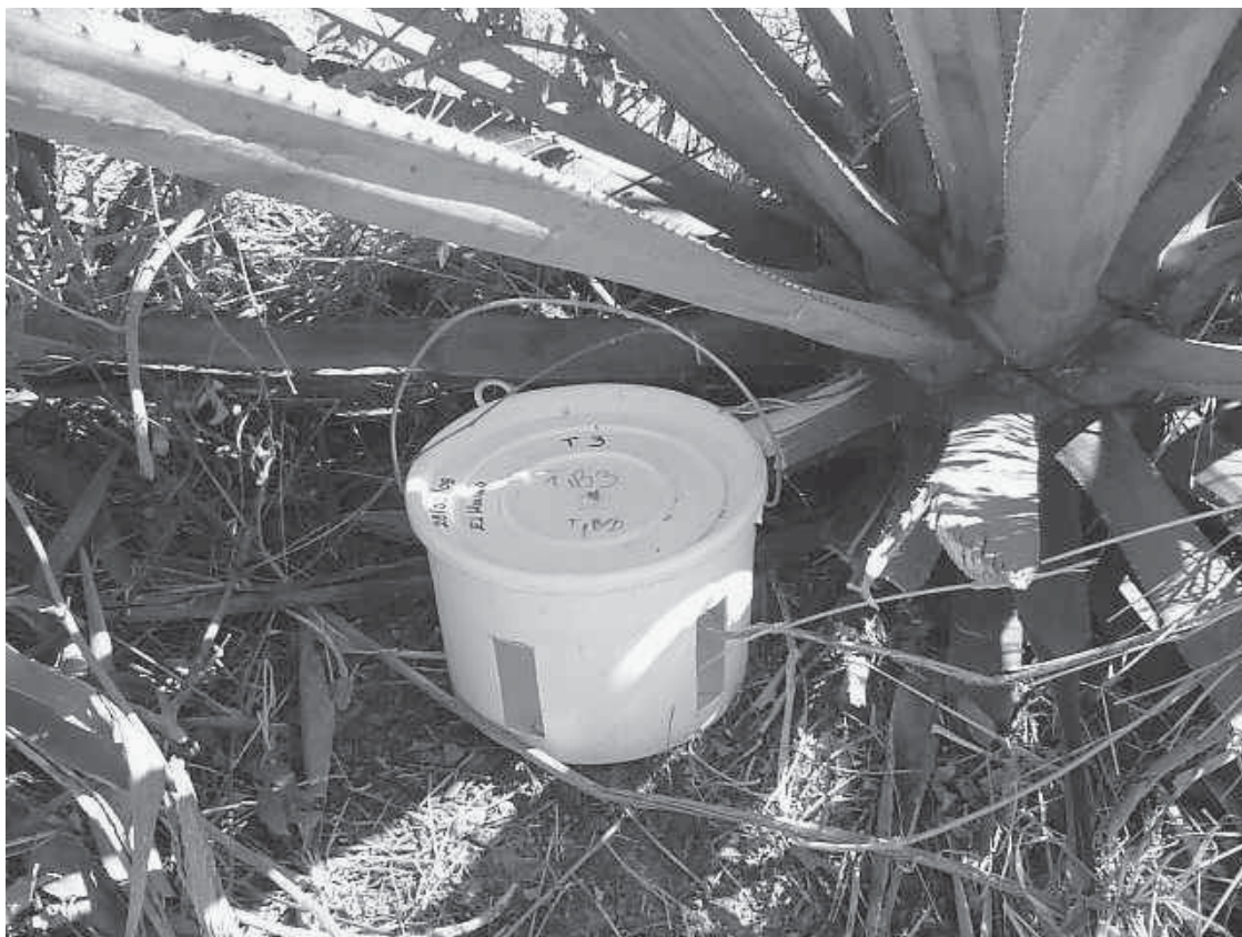
Fig. 1. Trap used to capture Scyphophorus acupunctatus in commercial plantations of Agave tequilana Weber var. 'Azul' in Jalisco, Mexico. The trap was designed by Rangel (2007).

plants) (Table 2). Negative correlations were found between the number of adults on plants and relative humidity ( r = 0.76 , P = 0.002 ) and the total number of weevils (including all developmental stages except eggs) on plants and relative humidity ( r = 0.67 , P = 0.009 ). The number of adults and the total number of weevils (including all developmental stages except eggs) on the plants were not correlated with temperature or precipitation.