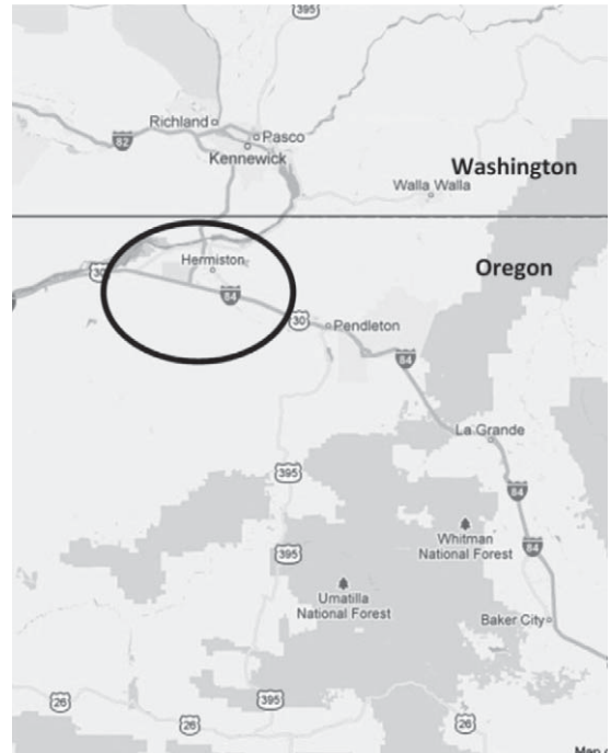
Fig. 1. Map of eastern Oregon. The lower Columbia basin is one of the richest irrigated agriculture areas in the world. Circle shows the area where field plots were located (N 45.8411° W 119.2917°; N 45.8356° W 119.6992°).

In 2007 and 2008, ground beetles were surveyed in first yr commercial organic ( n = 3 ) and conventional potato fields ( n = 4 ) in the Boardman and Hermiston area located east of the Cascade Mountains in Oregon (Fig. 1). Insects were collected with pitfall traps; pitfall traps are widely used to collect soil arthropods in both agricultural and natural systems (Southwood 1978; Adis 1979; Weeks et al. 1997; Hansen & New 2005; O'Rourke et al. 2008). Ten pitfall traps per field were placed in a linear transect; traps were 15.2 m apart. Traps were placed in the rows to prevent flooding from irrigation. Typically potatoes are hilled, creating deep furrows between rows, and thus