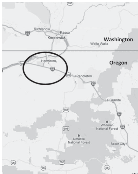
Fig. 1. Map of eastern Oregon. The lower Columbia basin is one of the richest irrigated agriculture areas in the world. Circle shows the area where field plots were located (N 45.8411° W 119.2917°; N 45.8356° W 119.6992°).

In 2007 and 2008, ground beetles were surveyed in first yr commercial organic ( n = 3 ) and conventional potato fields ( n = 4 ) in the Boardman and Hermiston area located east of the Cascade Mountains in Oregon (Fig. 1). Insects were collected with pitfall traps; pitfall traps are widely used to collect soil arthropods in both agricultural and natural systems (Southwood 1978; Adis 1979; Weeks et al. 1997; Hansen & New 2005; O'Rourke et al. 2008). Ten pitfall traps per field were placed in a linear transect; traps were 15.2 m apart. Traps were placed in the rows to prevent flooding from irrigation. Typically potatoes are hilled, creating deep furrows between rows, and thus