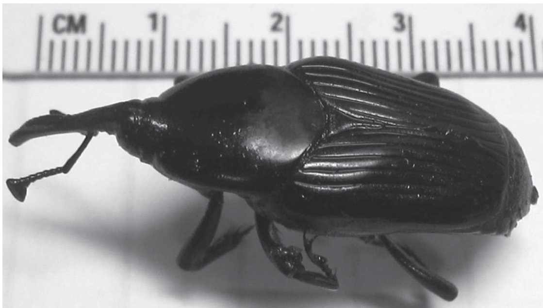
Fig. 2. Rhynchophorus palmarum male from Alamo, Texas.