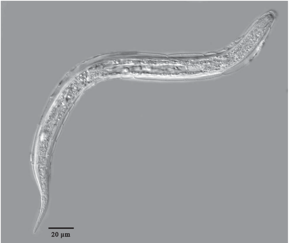
Fig. 4. Dauer juvenile diplogastrid nematode (Unidentified Rhabditida) from Rhynchophorus palmarum showing bunched, sticky outer cuticle, differential interference contrast optics.

marum can be easily established in subtropical environmental conditions, especially with the presence of the wide variety of host plants found in the Lower Rio Grande Valley including several ornamental palms, coconut and oil palms, and sugarcane. Secondly, if R. palmarum does become successfully established, it could be moved to the rest of the southern U.S., affect the ornamental palm industry, and infest and negatively impact sugarcane plantations in South Texas, Louisiana, and Florida. Finally, this weevil is a vector of red ring nematode B. cocophilus , which causes red ring disease that is lethal to many palm tree species, and that further increases economic damage to commercial palm plantations and urban landscapes.