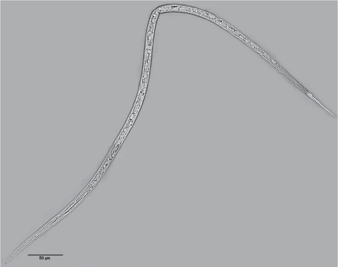
Fig. 3. Adult female nematode (unidentified member of Aphelenchoididae) found inside Rhynchophorus palmarum , polarization optics.

mite workers foraging there. The association of R. rainai and R. palmarum could be an inverse association from that of the B. cocophilus -termite association from a habitat that supports diverse invertebrates.