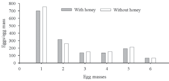
Fig. 1. Number of eggs per egg mass of Thyriniteina arnobia (Lepidoptera: Geometridae) fed or unfed on 15% honey solution at 22.39 \pm 1.48 °C and 82.35 \pm 6.56\% RH.

males showed 100% survival until the fifth day, compared to only 45% of unfed males. Few unfed males survived until the twelfth day, but 20% of honey-fed males survived for that period (Fig. 2A).