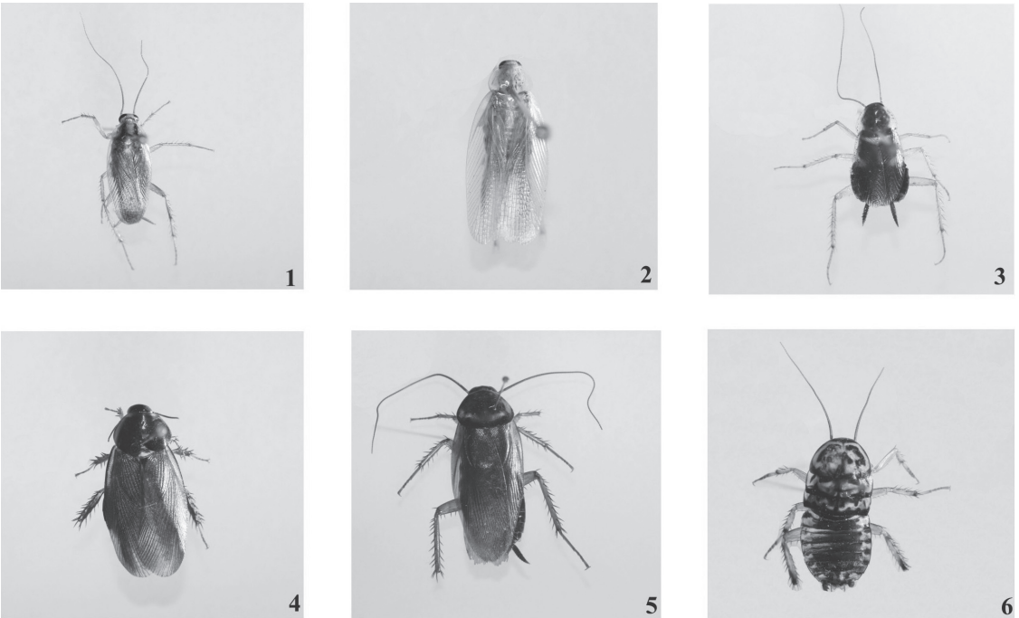
Plate 2. Habitus (dorsal view) of each of 6 Blattodea species in Kolhapur District, Maharashtra State: 1. Blatella germanica , 2. Blatella humbertiana , 3. Supella (supella) longipalpa , 4. Pycnoscelus surinamensis , 5. Periplaneta americana , and 6. Neostylopyga rhombifolia