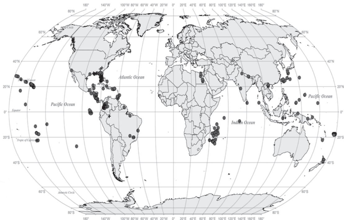
Fig. 2. Worldwide distribution records of Cardiocondyla minutior . Circle = C. minutior record. + = unconfirmed New World ' C. nuda ' record.