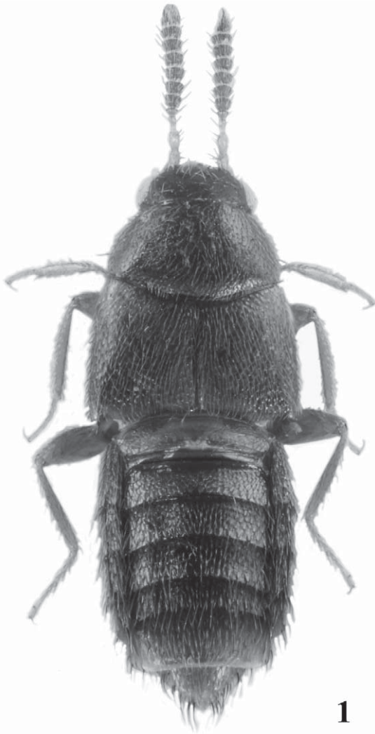
Fig. 1. Habitus of Agaricomorpha ashei sp. nov. 1.6 mm.

3) with distinct median tooth, prostheca well developed, divided into two distinct areas, condylar molar patch narrow, composed of toothlike structures; maxillary palpomeres (Fig. 4) 2–3 dilated distally, 4 with a small spine at apex; labium (Fig. 5) with ligula protruded, parallel-sided, divided in apical three-fourths, almost as long as labial palpomere 1, labial palpus with two palpomeres,